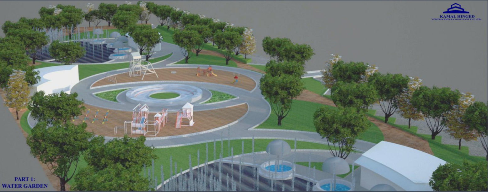
PART 1: WATER GARDEN